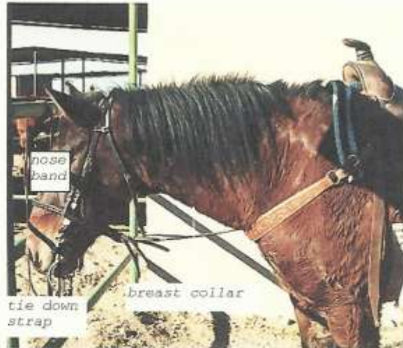
Some optional equipment.

The breast collar is used to stabilize the saddle when riding in rough country, or roping. It also holds the saddle in place on a round-backed horse, or a slim-gutted horse.