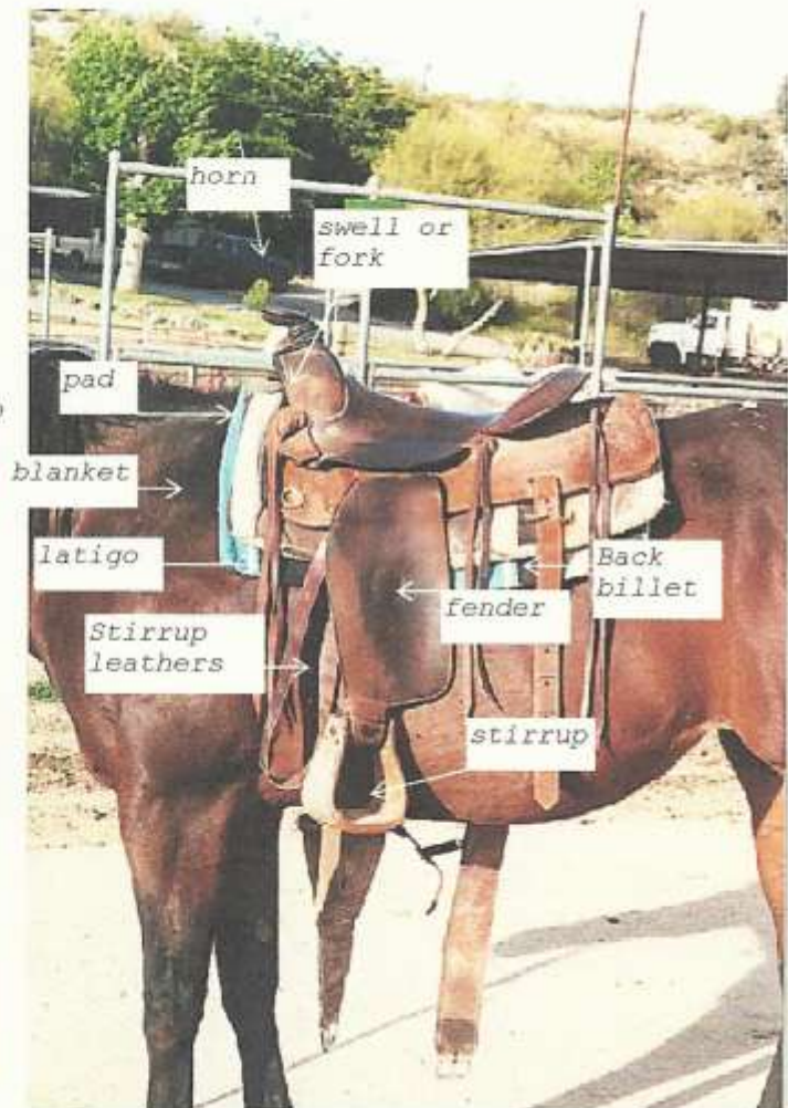
The saddle--left side.

Most of the equipment shown is standard, or necessary.